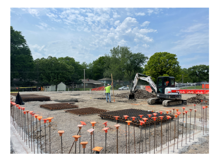
Prep for Spread Footings