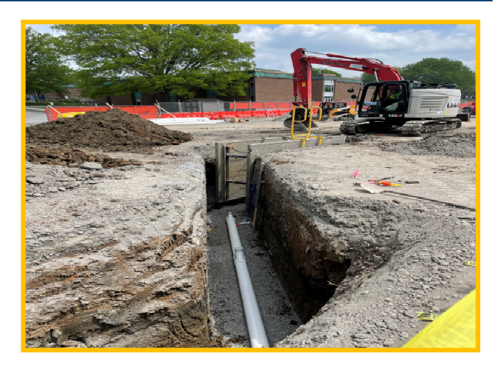
Install Plumbing Underground