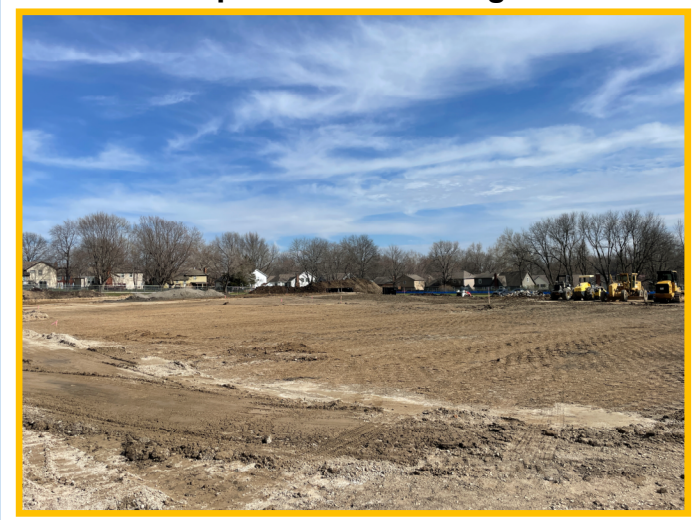
hollis + miller