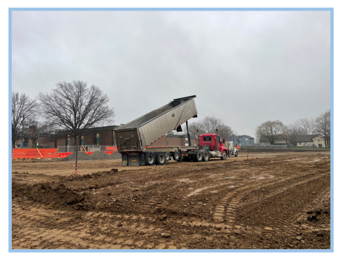
Imported Material For Building Pad