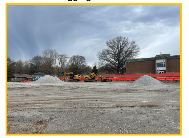
Building Pad Prep