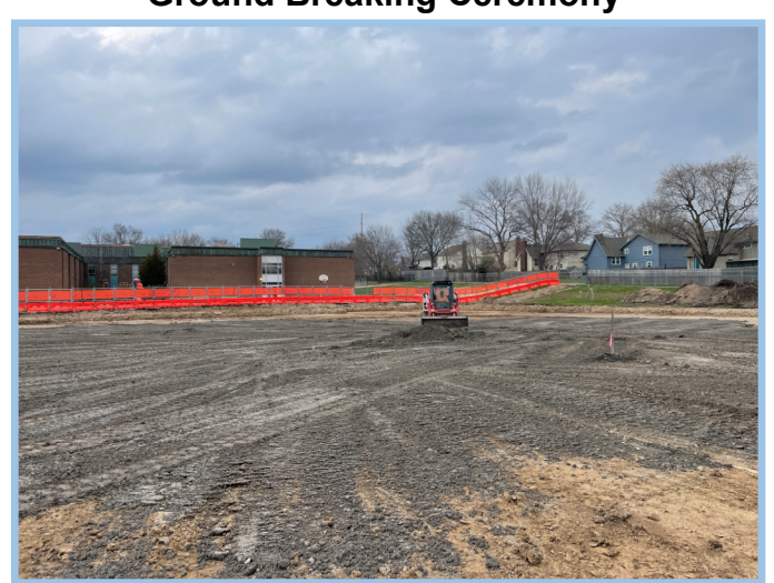
Building Pad Prep