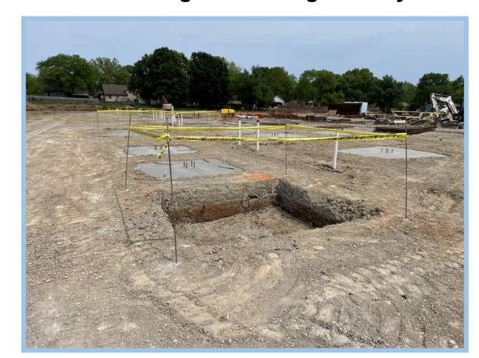
Prep for Spread Footings hollis + miller