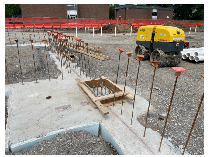
Continued Pouring Footings