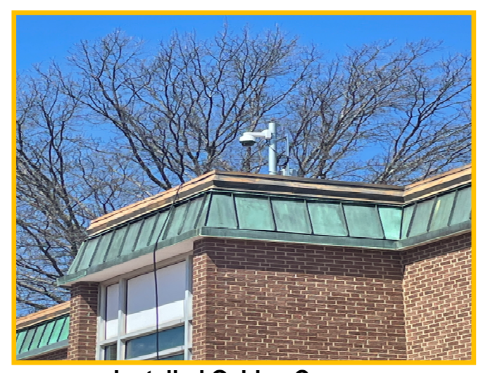
Installed Oxblue Camera