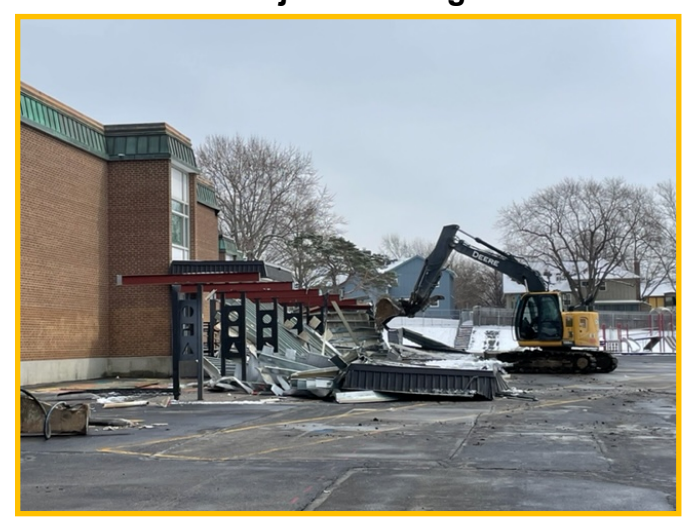
Removed Existing Canopy