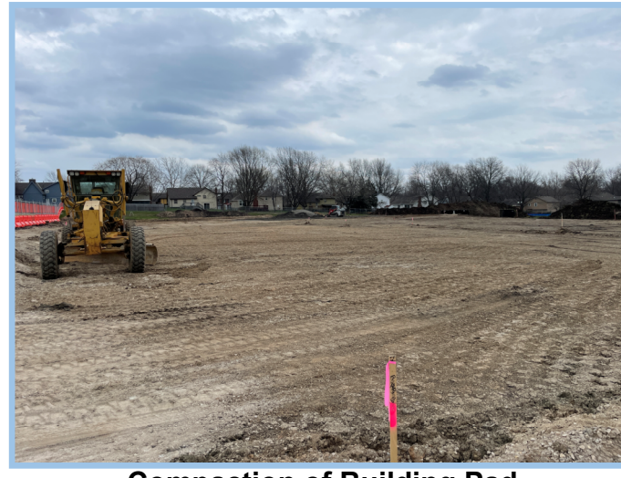
Compaction of Building Pad