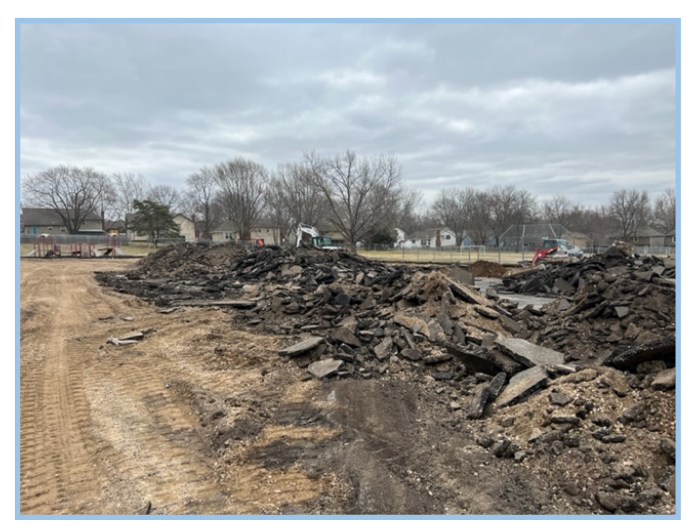
Prep For New Building Pad