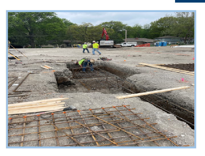
Footing Reinforcement Install