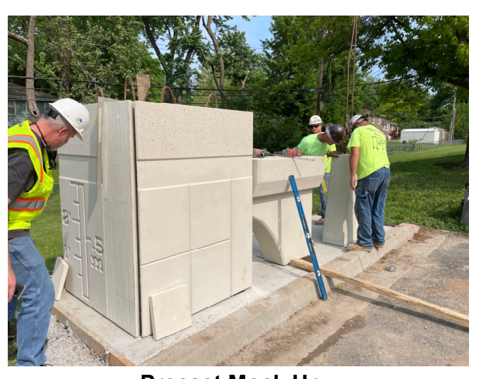
Precast Mock Up