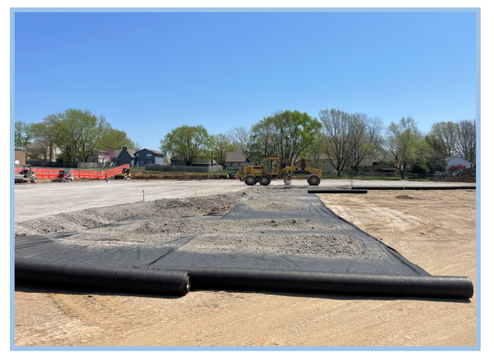
Laydown Filter Fabric