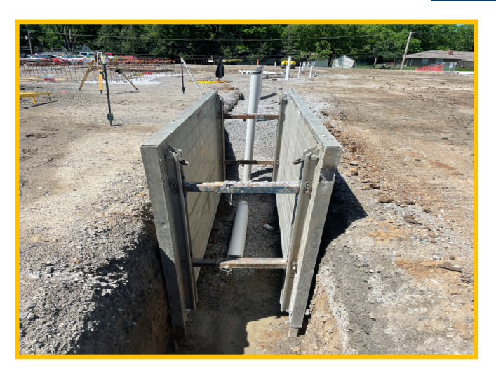
Plumbing Underground Sanitary