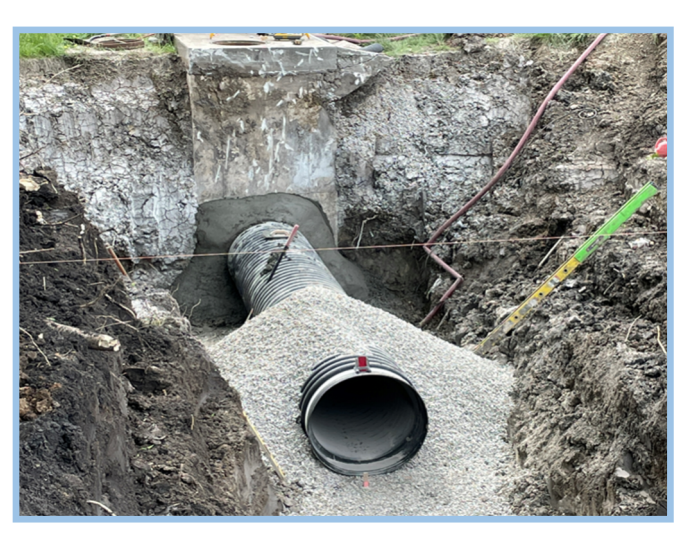
Storm Sewer Install