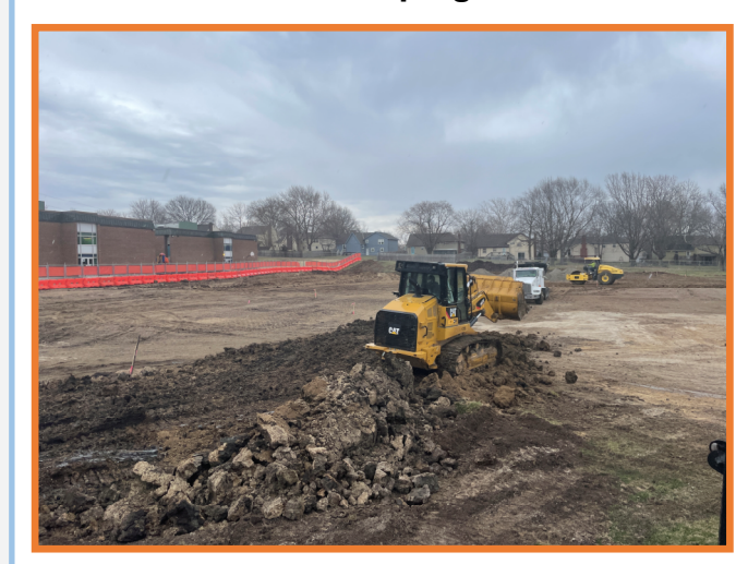
Continue Prep For New Building Pad