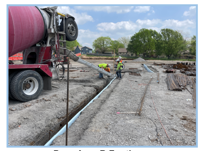
Pour Area B Footings