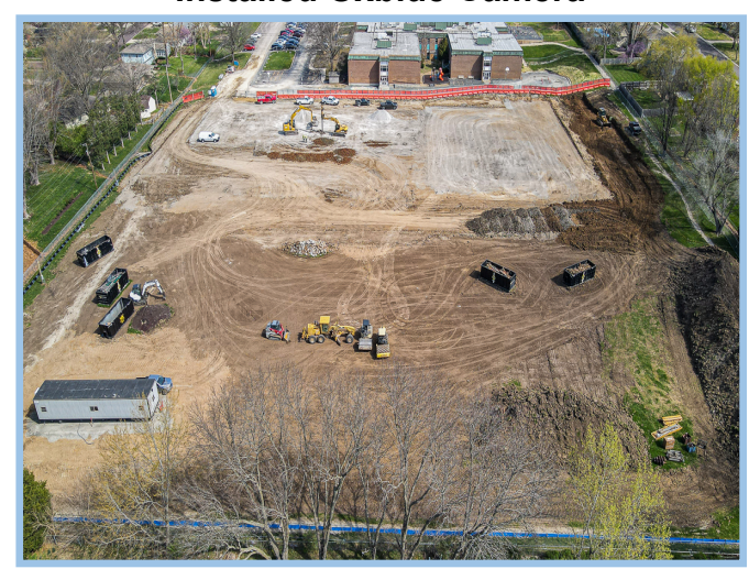
hollis + miller