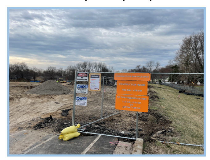
Temp. Fencing and Signage