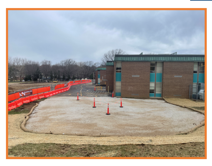
Temp. Pickup Loop