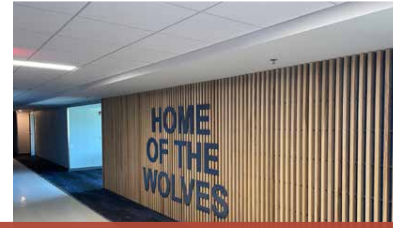
A new addition to Indian Woods Middle School has provided upgrades to student learning spaces. Through the bond, Indian Woods will also have classroom furniture replacement and restroom renovations.