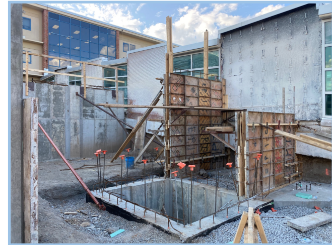
Pour CIP Walls South Of Elevator Pit