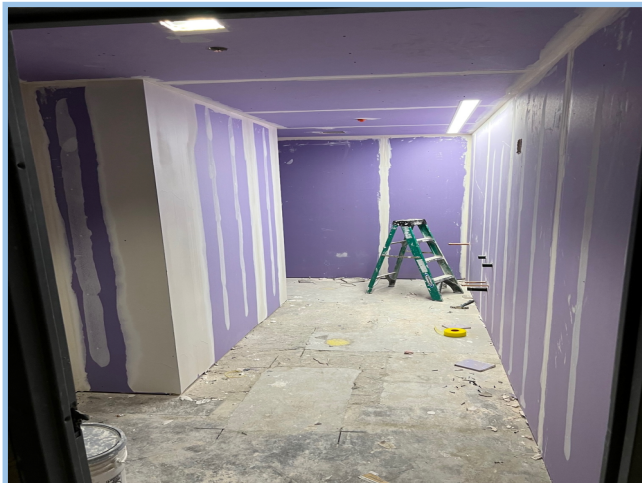
Level 1 Drywall Tape & Finish