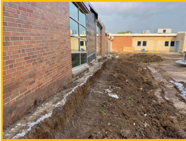
Saw Cut Existing Footing/Haunch