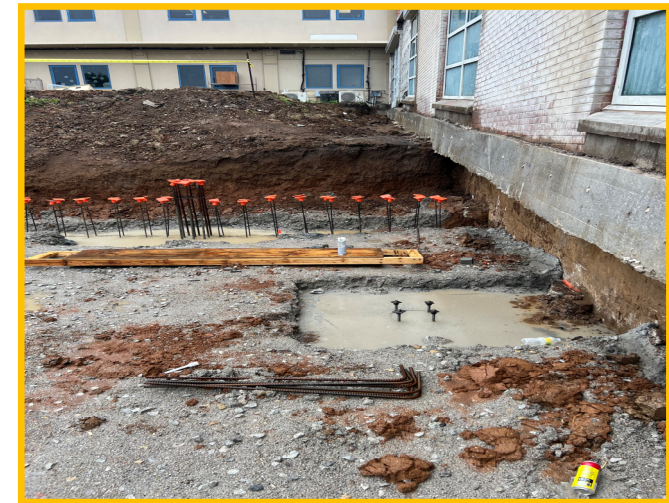
Poured Gridline 5/A