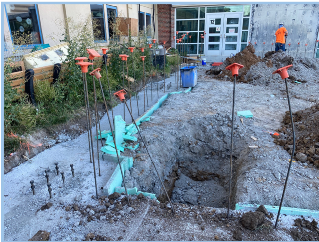
Level 3 Footings Poured