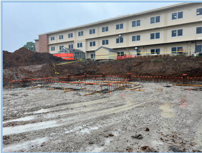
Began Pouring Footings & Foundations