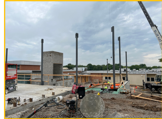
Addition Steel Erection