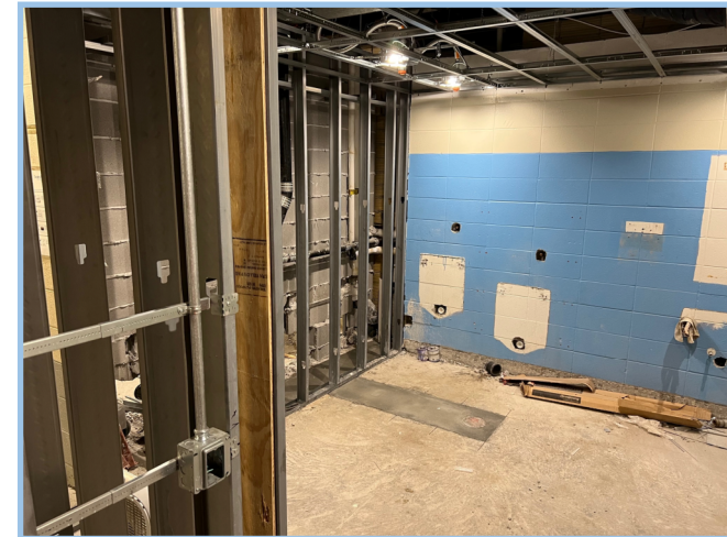
Level 2 Framing & MEP Install