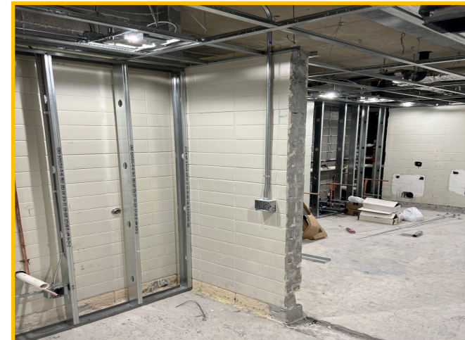
Level 4 Framing & In-Wall