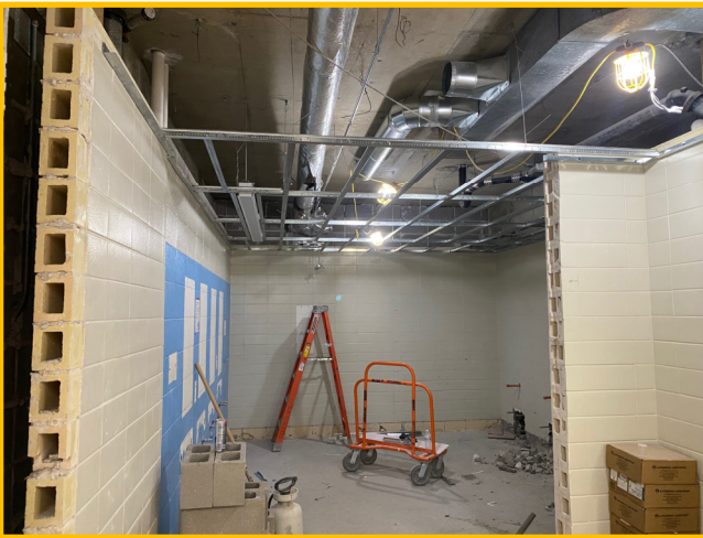
Level 4 OH Framing and Electrical Install