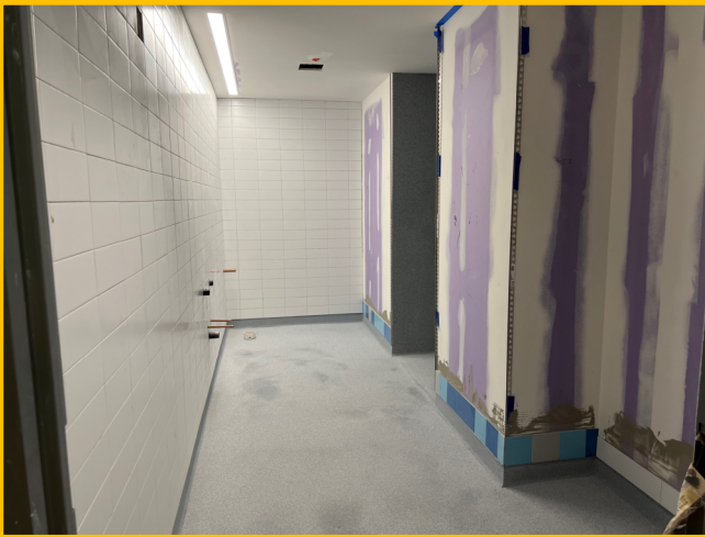
Level 1 Renovation Finishes