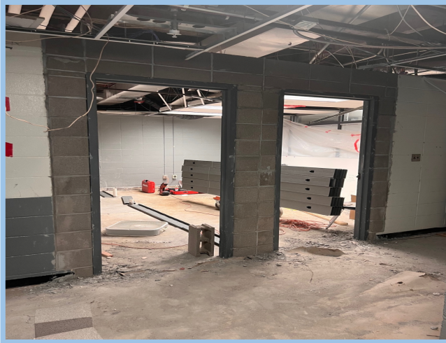
Level 1 New Openings Infill