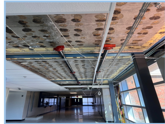
OH Fire Suppression Lines Install