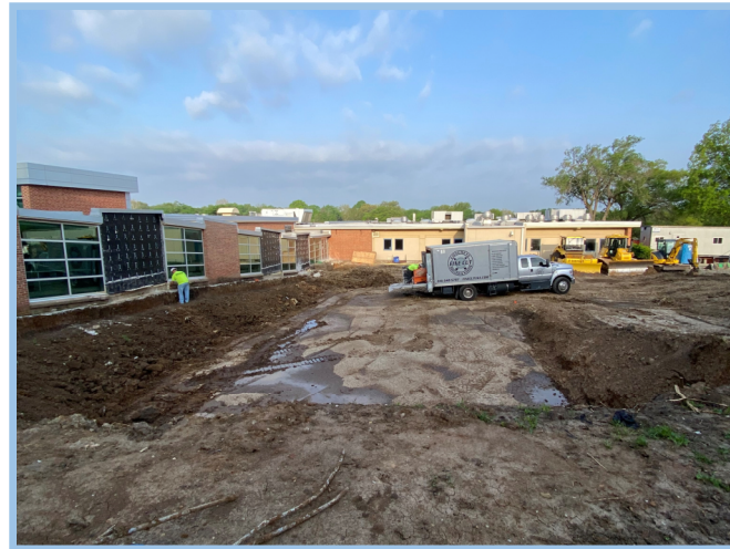
Continue Site Grading & Compaction