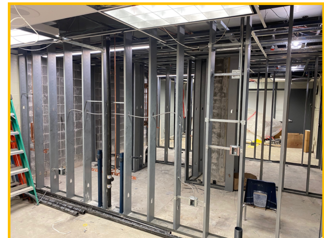
Level 1 Office/Restroom Framing