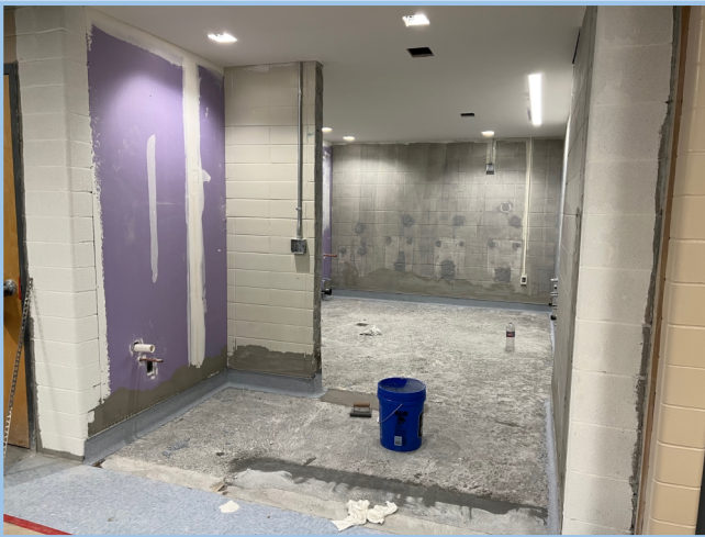
Level 4 Renovation Finishes