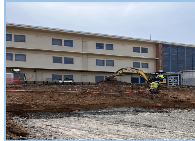
Relocate Existing Fiber Line