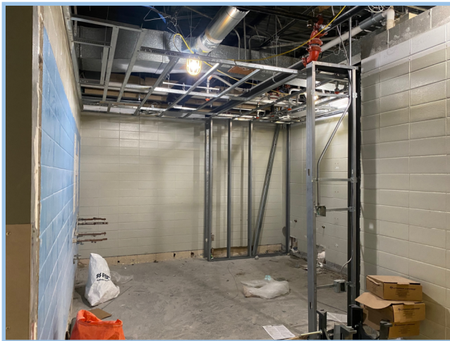
Level 2 OH & Wall Framing