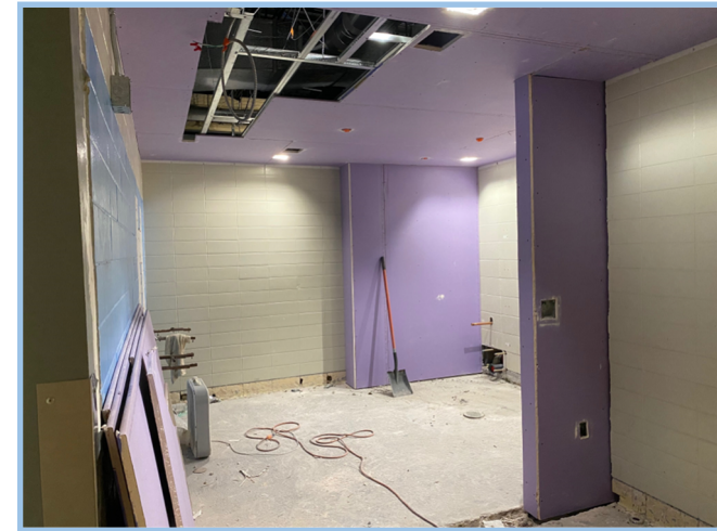
Level 2 Framing, Tape & Finish