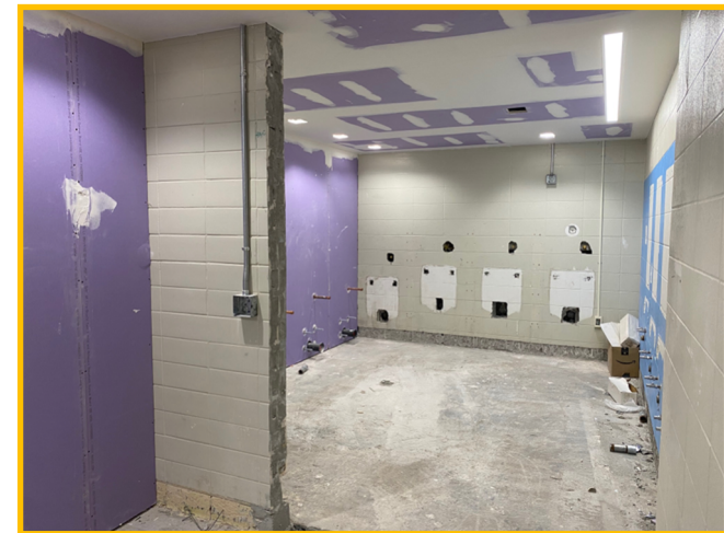
Level 4 Framing, Tape & Finish