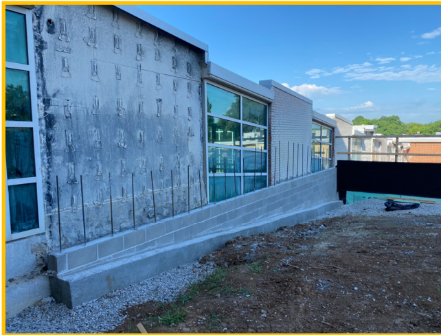
New Footing & Block Retaining Wall