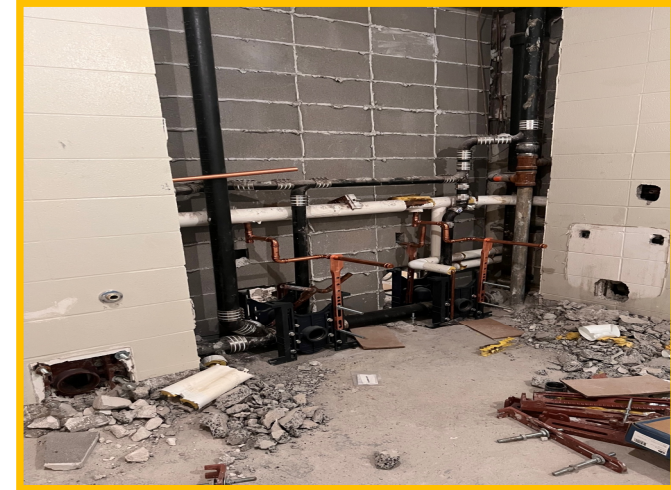
Level 2 Plumbing Fixture Install