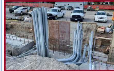
Electrical Service - Building Entry Conduits