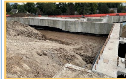
Gym Retaining Wall - Interior Backfill