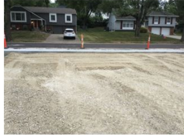
Sidewalk at NE Entrance