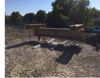
Test on RAP