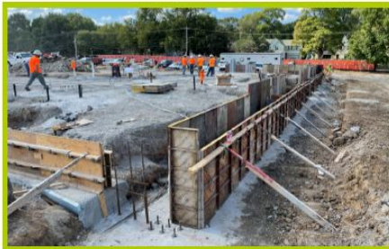
Area A - Stem Wall Formwork & Pours