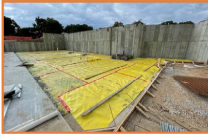
Area C - Slab-on-Grade #3 Prep & Pour