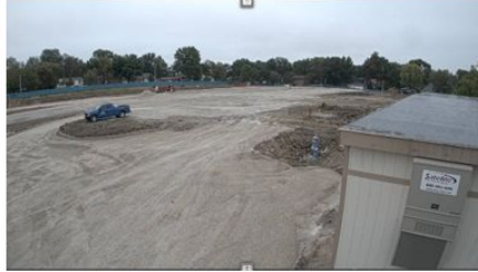
Overview of Jobsite

Week 27 th – October 1 st Grading Around Jobsite Electrical Underground From pole to Transformer.