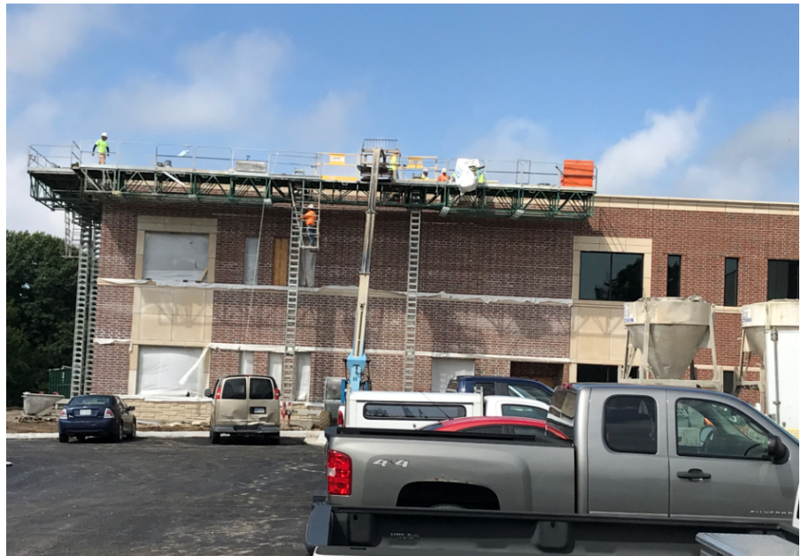
Exterior Stone & Brick, Window Frame & Window Installation on East Side of Area A