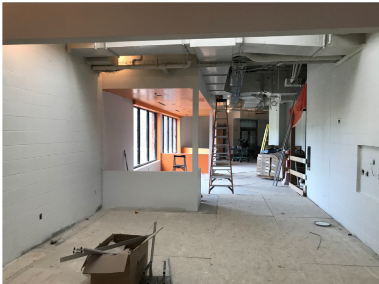
Collaboration Spaces / Soffits on 2 nd Floor Area A