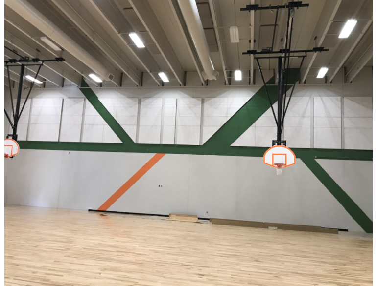
Tectum Panels in Gym Area D