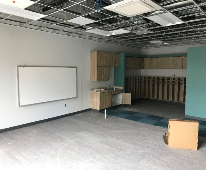
Classroom Area B – Casework, Carpet, Ceiling Grid