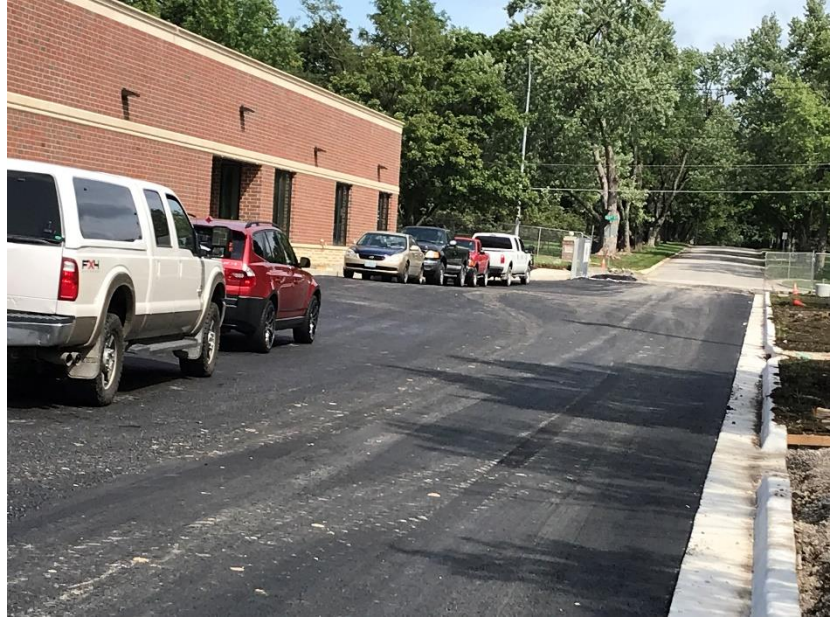
Base Coat Asphalt East Drive and Parking Lot