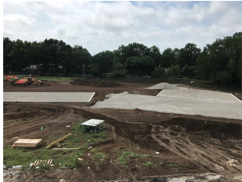
Concrete Curbs and Rock for Soft Play Area and Rock for Hard Play Area